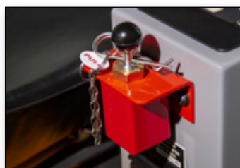
Fire Suppression Control