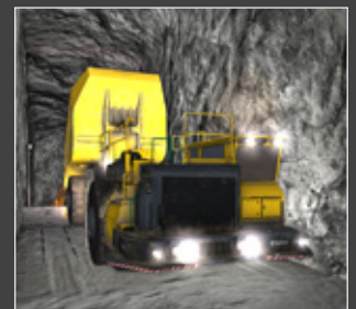
Machine dynamics faithfully reproduced to give maximum realism

With mining equipment becoming increasingly technically sophisticated, the level of information, experience and organizational competencies required to accurately simulate these machines also increases. Through Immersive Technologies' industry experience, you can be assured your training solution will be the only accurate and true representation of the real machine available.