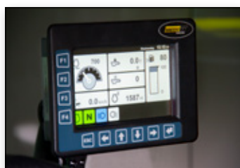
Rig Control System display