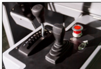
Gear and Dump Controls