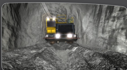
Safe Operating Procedures