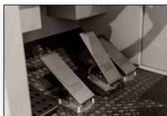
Full pedal base controls