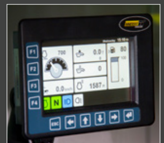
Accurate instrumentation and controls provide a safe and highly realistic training environment