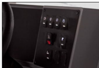
High fidelity devices and switches