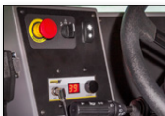
Radio and Emergency Devices