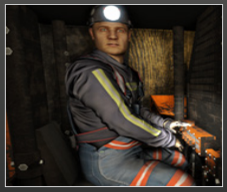
Machine controls faithfully reproduced to give the maximum realism