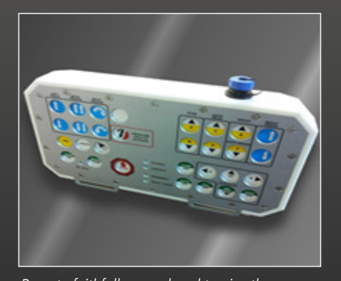
Remote faithfully reproduced to give the maximum realism.