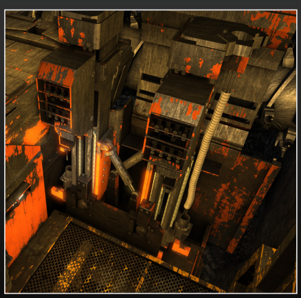
Bolting stations faithfully reproduced to give the maximum realism.