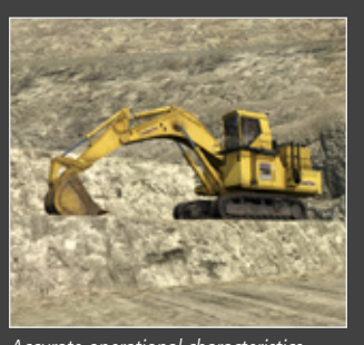
Accurate operational characteristics using technology and proprietary data licensed from Komatsu

With mining equipment becoming increasingly technically sophisticated, the level of information, experience and organizational competencies required to accurately simulate these machines also increases. Through Immersive Technologies' industry experience and exclusive alliance with Komatsu, you can be assured your training solution will be the only accurate and true representation of the real machine available.