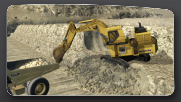
Safe Operating Procedures