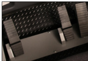
Clutch, brake and throttle pedals match real machine cab