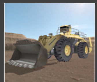
Accurate operational characteristics using technology and proprietary data licensed from Komatsu

With mining equipment becoming increasingly technically sophisticated, the level of information, experience and organizational competencies required to accurately simulate these machines also increases. Through Immersive Technologies' industry experience and exclusive alliance with Komatsu, you can be assured your training solution will be the only accurate and true representation of the real machine available.