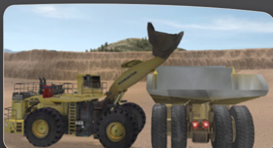
Safe Operating Procedures