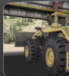
Startup / Shutdown