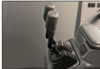
Bucket and boom control levers