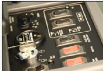
Replica engine RPM Set System