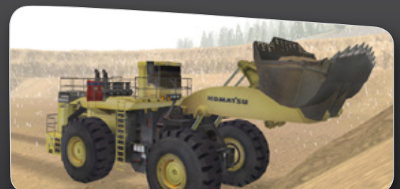
Adverse Weather Conditions