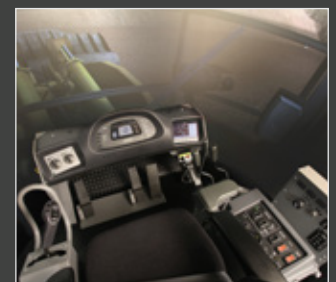
Conversion Kits® utilize genuine Komatsu cab controls and instrumentation