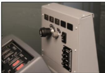
Functional wiper and special views switches