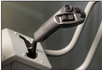
Advanced Joystick Steering System (AJSS)