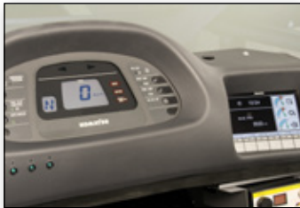
Main Monitor EDIMOS II (Electronic Display Monitoring System)

These include an operational 'Electronic Display Monitoring System' (EDIMOS II), Komatsu's powerful functional monitor panel well received by operator's worldwide displaying on-line travel speed, gear position, travel-conditions along with diagnostic capabilities designed to work together for higher production, greater reliability and more versatility.