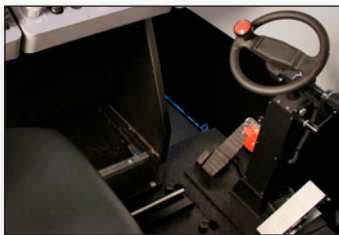
Full tramming capability