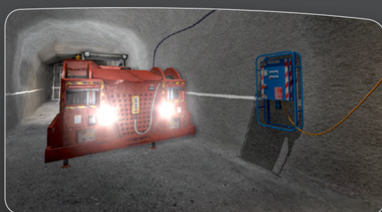
Connecting to Site Services