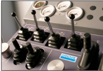
Complete drill and boom controls

Full tramming functionality is included and covers connecting to site services, hydraulic jacks and negotiating tight corners.