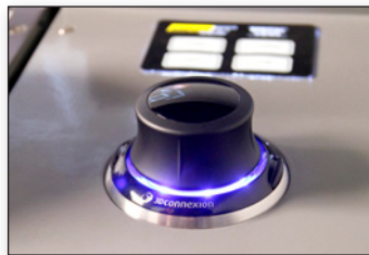
Special views and walkaround control