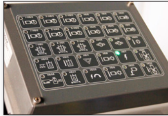
Genuine Sandvik parts