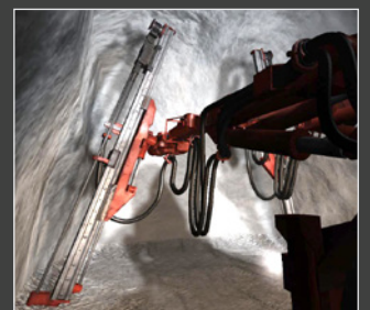
Machine dynamics faithfully reproduced to give the maximum realism

With the ability to accurately measure, assess and enhance an equipment operator's skill levels, the Advanced Equipment Simulator can improve safety and profitability on your site.