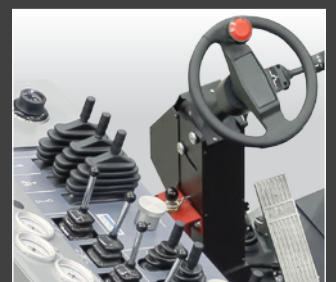
Accurate instrumentation and controls provide a safe and highly realistic training environment