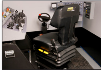
Sliding and rotating seat action