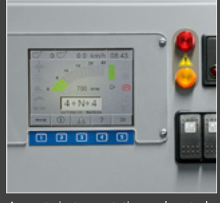
Accurate instrumentation and controls provide a safe and highly realistic training environment