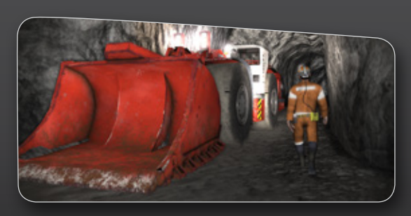
Safe Operating Procedures