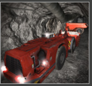
Machine dynamics faithfully reproduced to give maximum realism

With mining equipment becoming increasingly technically sophisticated, the level of information, experience and organizational competencies required to accurately simulate these machines also increases. Through Immersive Technologies' industry experience, you can be assured your training solution will be the only accurate and true representation of the real machine available.